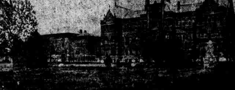
Best Kind of Environment for Study and Character Building. High Grade Faculty. Everything in the Way of Standard Education in College of Liberal Arts and Sciences

Nebraska Wesleyan University, University Place, Lincoln, Nebraska ::