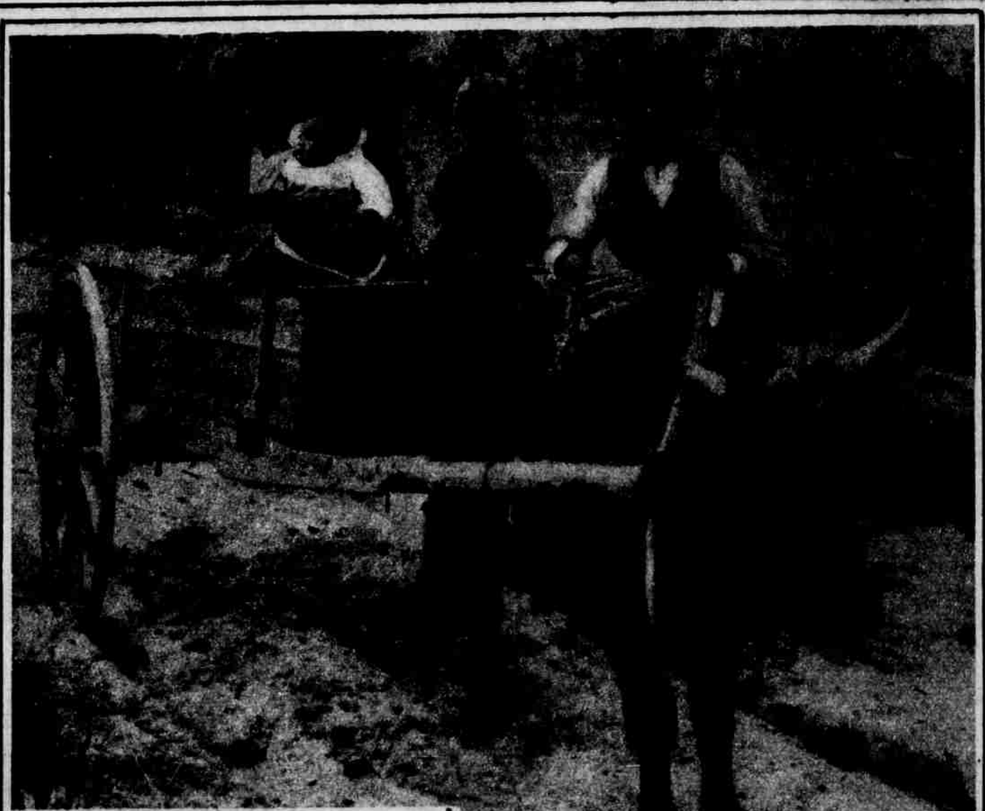
Ox-Cart, North Carolina.

By de of par De Who the ocr aw est puk Th cour to br dies lea isa lea tion was com dors but cut lo eis nat W tatio fore an dec mak any law state be of gen Mas in his ide W the nalf the pub res com neme tue gus If the ric we del to at the ca Be et S the of the ka ne gus Be C div the lic na pe A scr co nb ere of ri to ing pis for we tw fir Ch put co we Le ri E air ca be H D m I here a Rock for -E St of mo to the at S office been ab