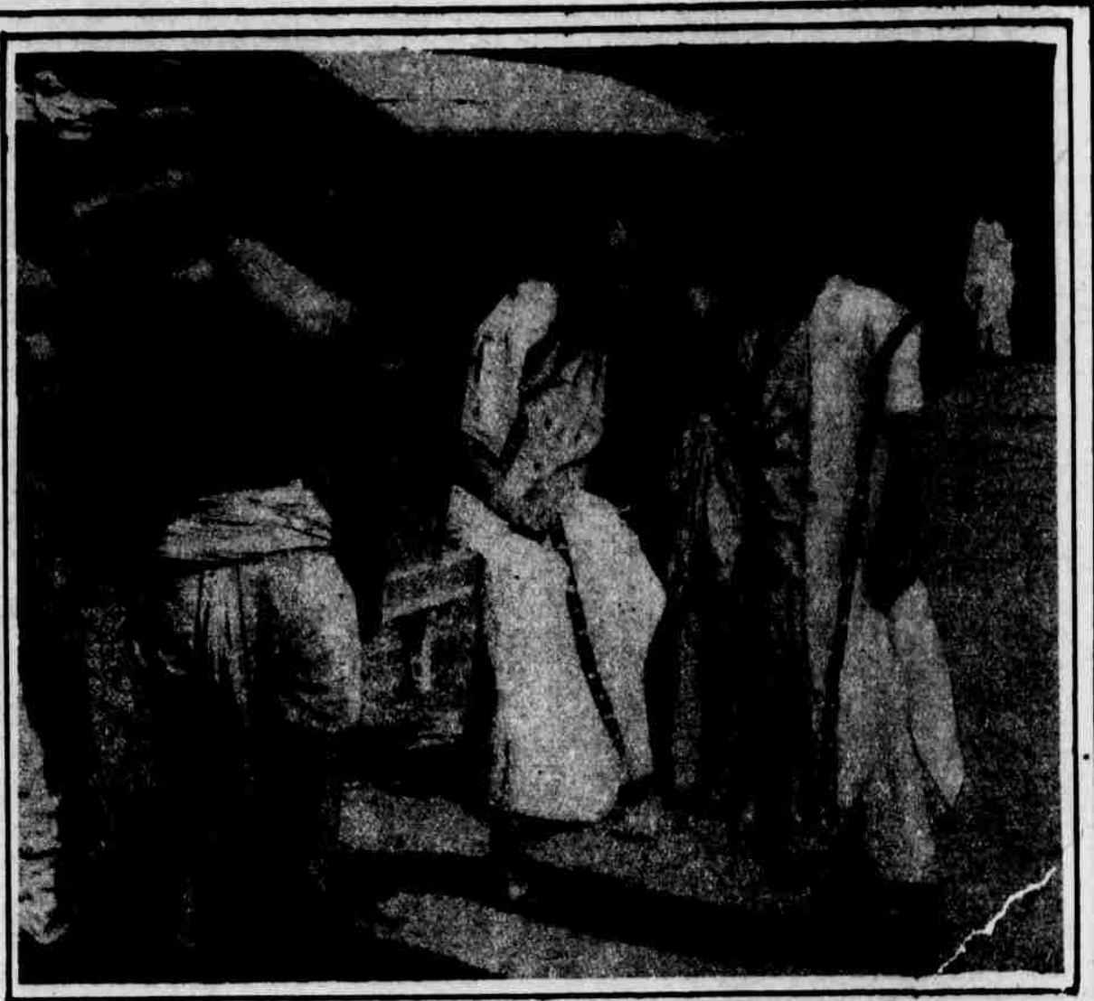
Palanquin, Calcutta, India.