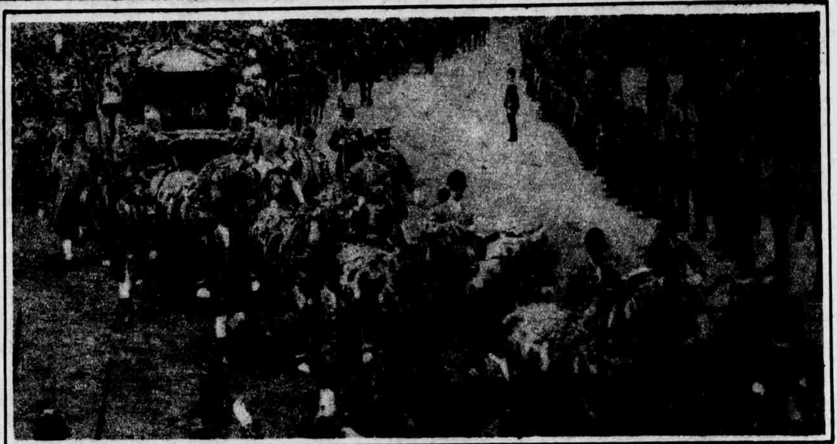
Royal Coach, England.