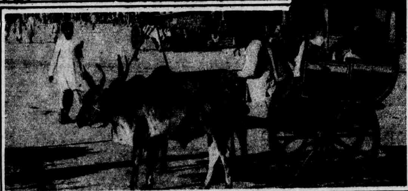
Ekka in Bombay, India.