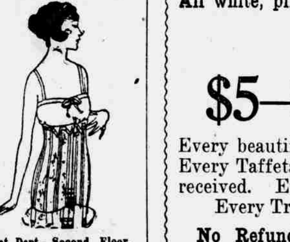
Corset Dept.—Second Floor.

Your choice of odds and ends of Corsets, pink batiste, summer nets, white coutils and fancy figures, range of sizes, 19 to 36. Regular price $3.00, special, at ..... $1.98 Brassieres and Bandeaux, front and back fastenings, lace and embroidery trimmed, special, at ..... 68c