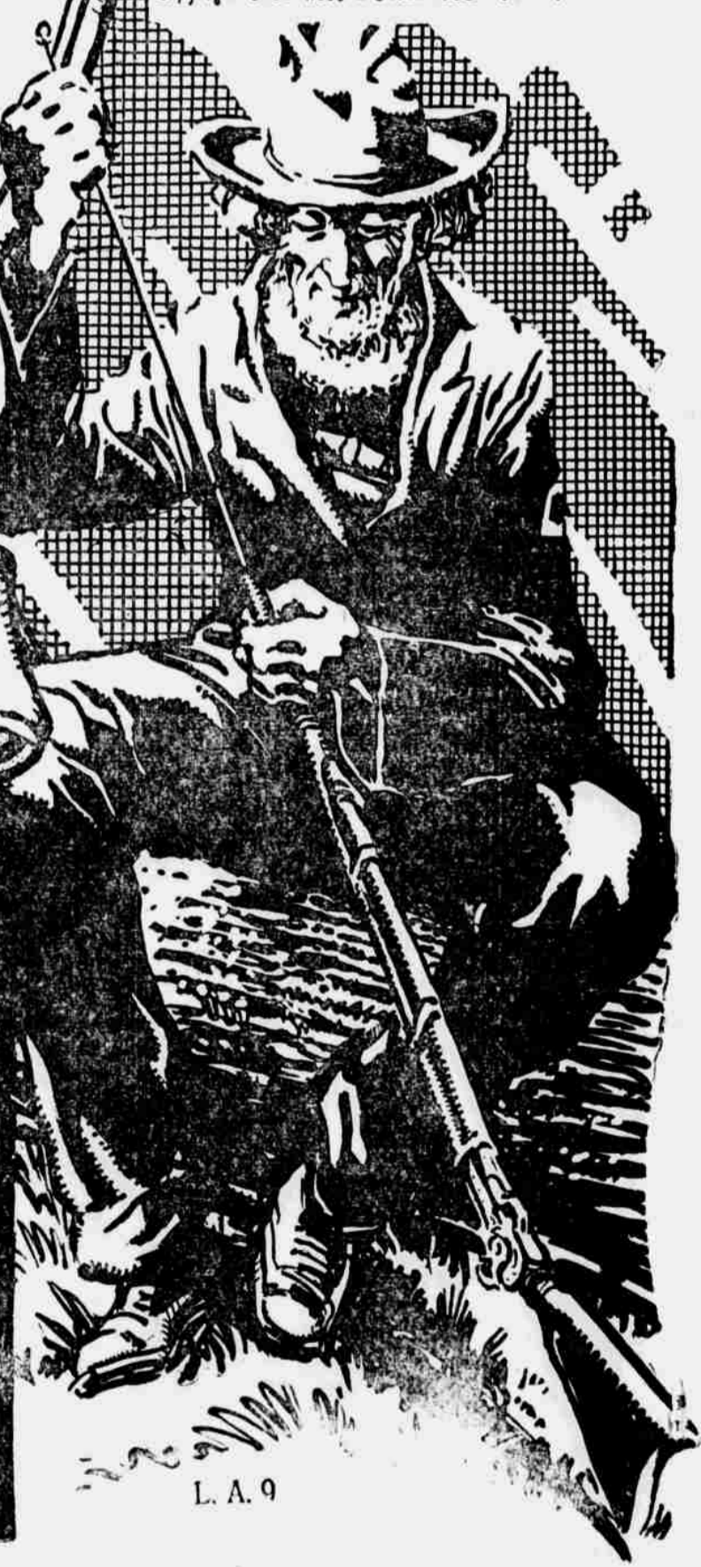
L. A. 9