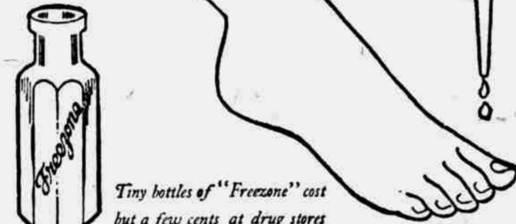
Tiny bottles of "Freezone" cost but a few cents at drug stores

Hard corns, soft corns, corns between the toes, and the hard skin calluses on bottom of feet lift right off—no humbug!