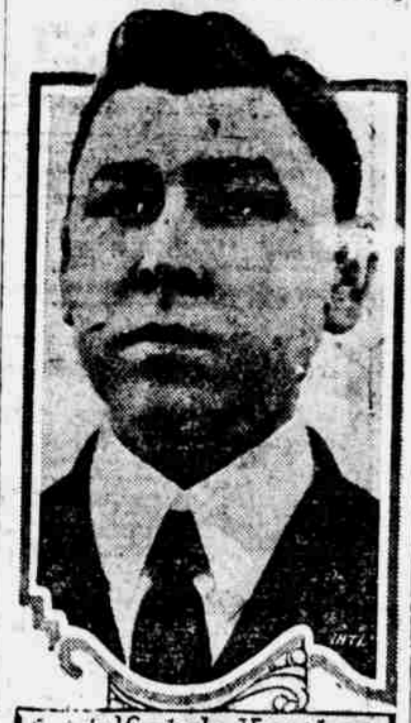
Adolfo de la Huerta.

Adolfo de la Huerta, who was sworn in recently as provisional president of Mexico. Thirty thousand Mexican troops paraded through Mexico City in honor of the inauguration. President de la Huerta was governor of Sonora, the first Mexican state to rebel against the Carranza regime.