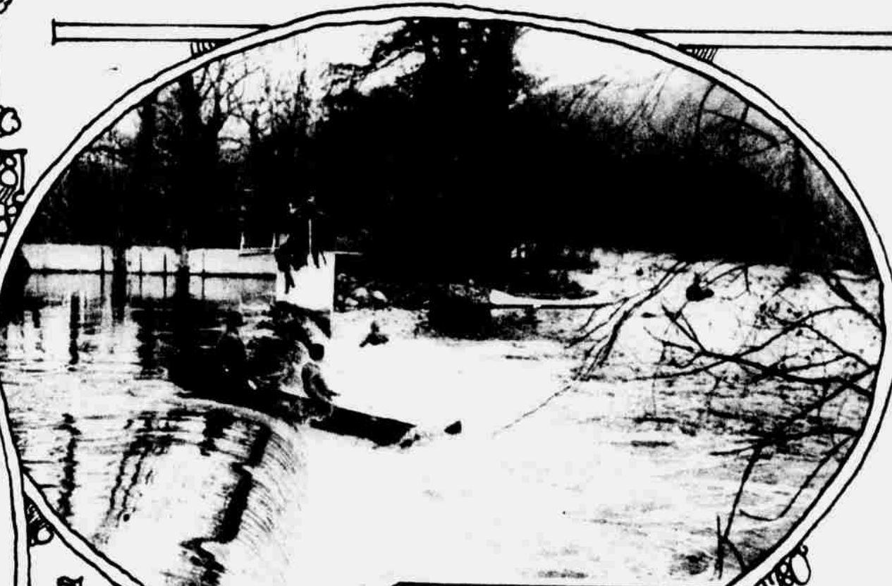
Shooting the rapids. Here is the really truly grown-up thrill of the whole affair. Smashed canoes and upsets are not uncommon and many a young paddler emerges blushing at a failure.