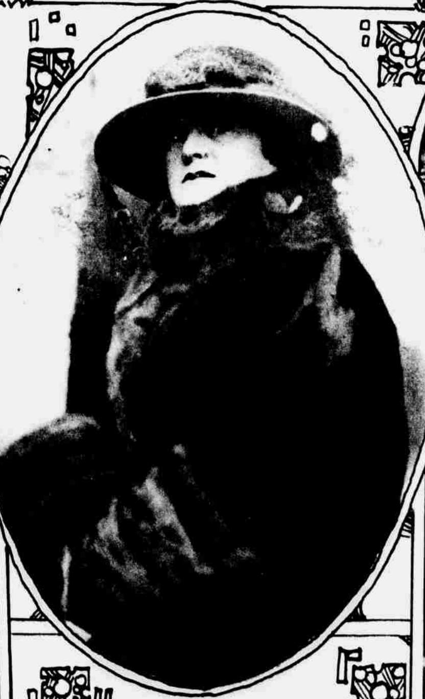
Mary Roberts Rinehart, the novelist, whose home is in Pennsylvania, is having her name filed there as a candidate for delegate to the Republican national convention. Mrs. Rinehart is having this done as a test to see whether a woman can aspire to such a masculine prerogative.