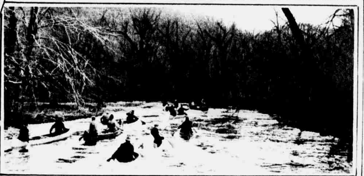
Here go the boys of the association through comparatively smooth waters, discussing as they go their individual prowess with the glittering paddles.