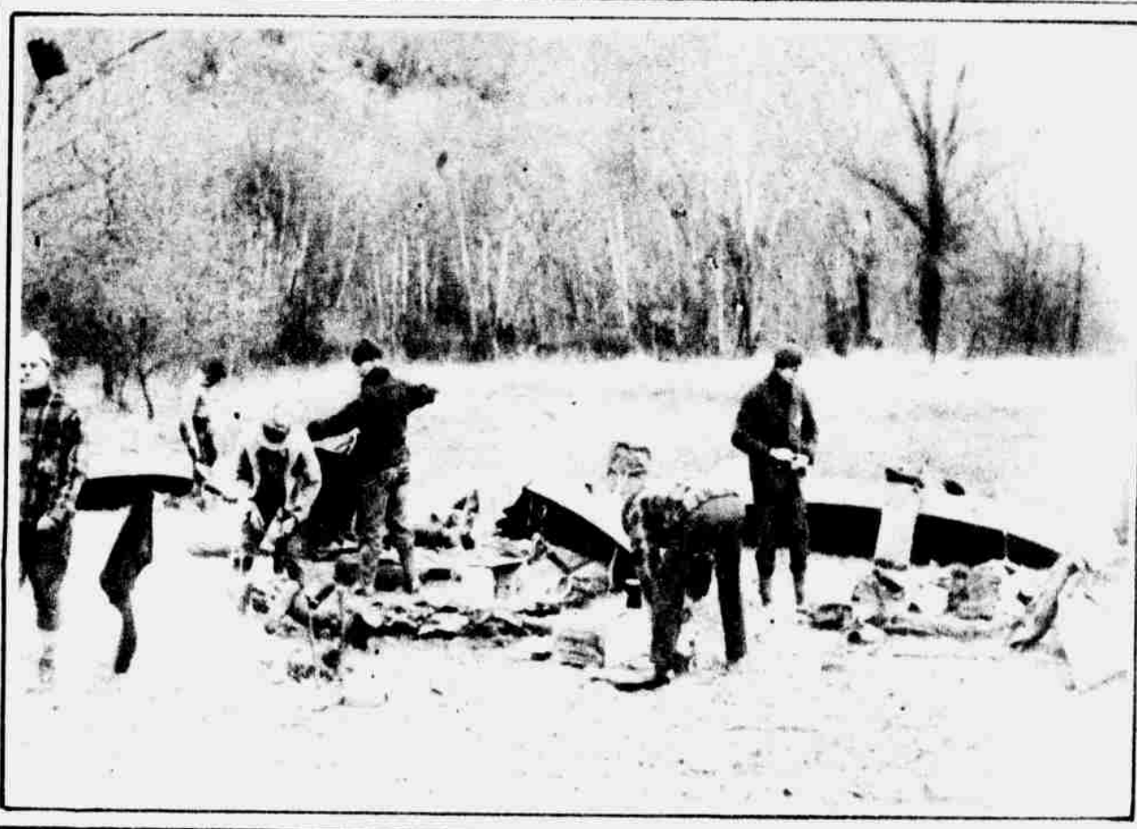
The members of the American Canoe Association stopping to dry their clothes and get a well-earned rest during their annual spring outing.