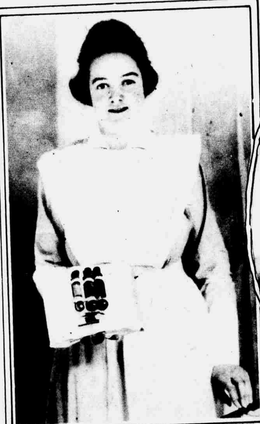
Three small tubes holding $48,000 worth of radium. A gram is worth $120,000. If you have any lying around on dusty shelves there is a good market for it.