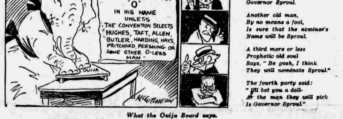
What the Ouija Board says.