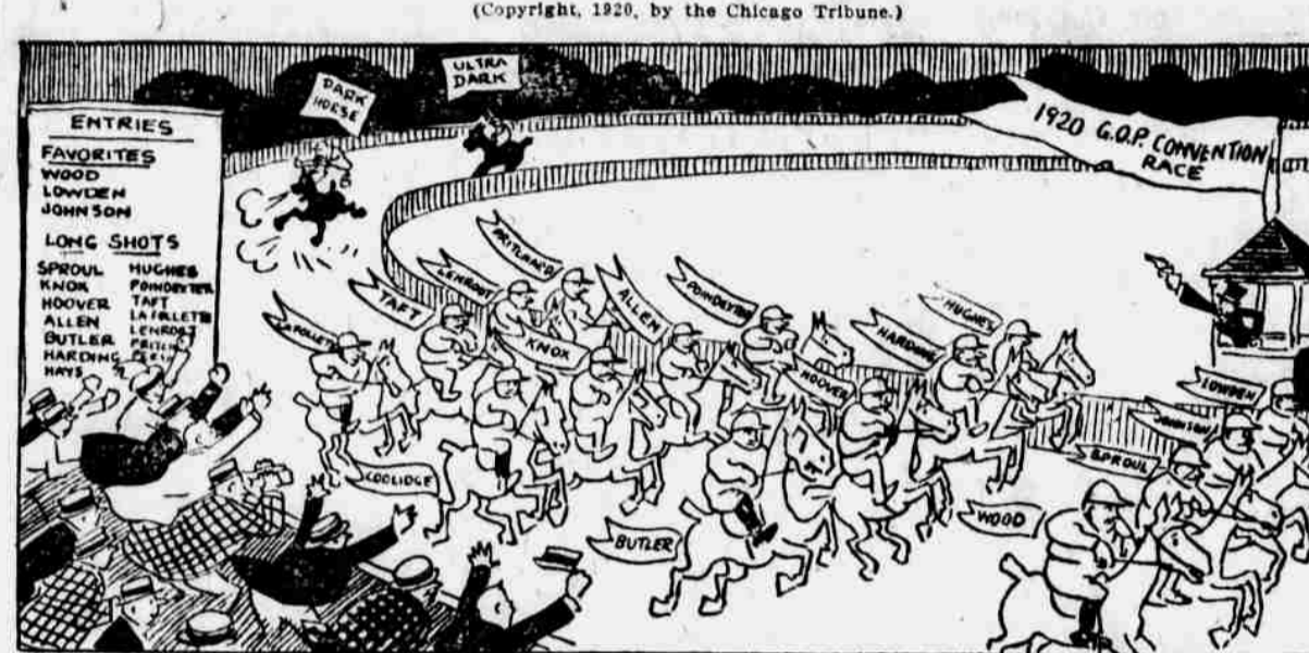
The starters will look like a squadron of cavalry. P. S.—A dry track is assured.