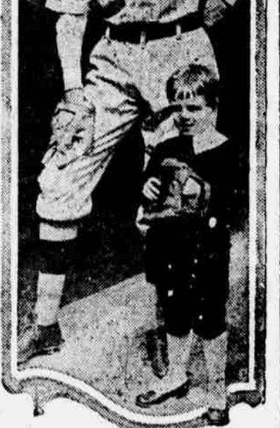
Rube Marquard and son