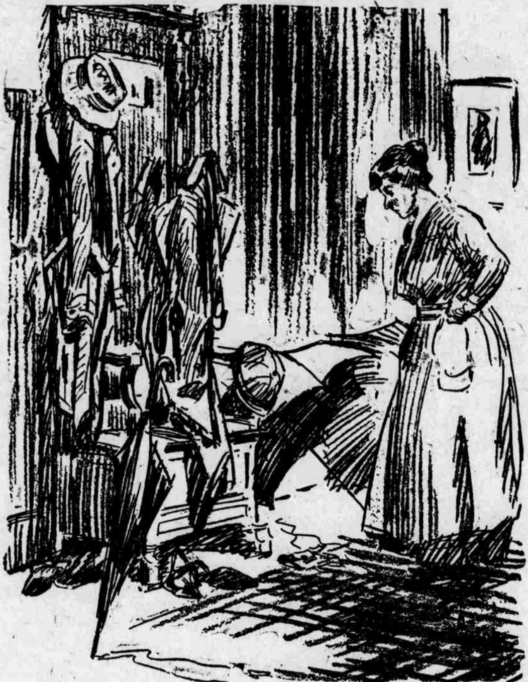
Won't It Ever Stop Raining?