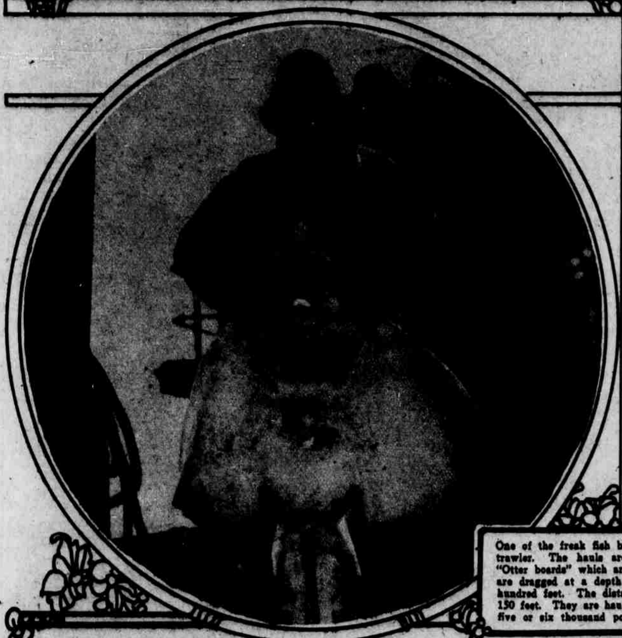
One of the freak fish brought up by a steam trawler. The hauls are made by means of "Otter boards" which are attached to nets and are dragged at a depth of from two to three hundred feet. The distance between boards is 150 feet. They are hauled up every hour with five or six thousand pounds of fish in them.