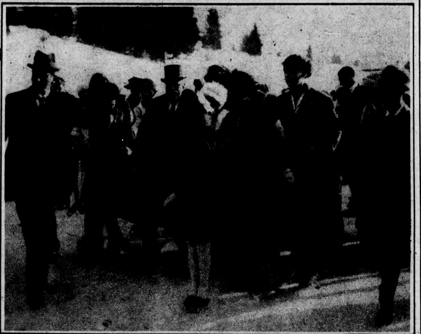
From Switzerland comes this picture of Marshal Joffre, the centre of attraction at one of the winter resorts in the Alps country. "Papa" seems to enjoy the attention of his admirers.