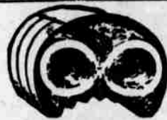
The water enters through the clothes in a figure 8 movement, and four times as often as in the ordinary washer.

has the improved double oscillation or the famous figure "8" movement, doubly cleaning the clothes with less wear and tear on the finer laces, silks, etc. The 1900 Cataract also has a "Quiet Zone," where the sediment and dirt washed from the clothes settles. Sediment settling in this "Quiet Zone" leaves the water cleaner, which in turn washes the clothes cleaner.