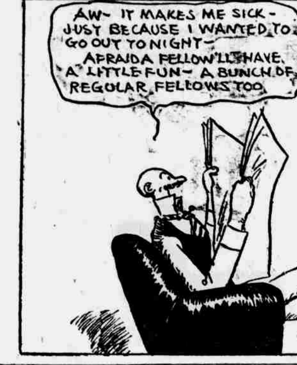
AW—IT MAKES ME SICK—JUST BECAUSE I WANTED TO GO OUT TONIGHT—A PRADA FELLOW'LL HAVE A LITTLE FUN—A BUNCH OF REGULAR FELLOWS TOO.