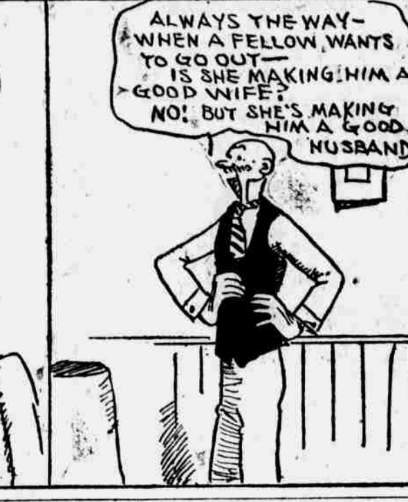
ALWAYS THE WAY—WHEN A FELLOW WANTS TO GO OUT—IS SHE MAKING HIM A GOOD WIFE? NO; BUT SHE'S MAKING HIM A GOOD HUSBAND.