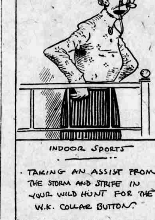
INDOOR SPORTS - TAKING AN ASSIST FROM THE STORM AND STREIF IN YOUR WILD HUNT FOR THE W.K. COLLAR BUTTON.

BARTHOLOMEW IT SEEMS TO ME THAT YOU'RE ALWAYS LOSING COLLAR BUTTONS - WHY DON'T YOU LOOK AFTER THEM MORE?