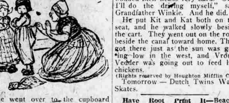
She went over to the cupboard and there were Kit and Kat.

Grandmother took Kit and Kat into the kitchen and shut the door. She put on her glasses and got down on the floor so she could see better. Then she turned Kit and Kat all around and looked at the holes. "O! my soul!" she said. She took off the apron and the torn clothes and put the twins to bed while she mended. "She got out a pair of grandmother's velvet patched breeches that had been patched a great deal, and found a good piece to patch with. Then she patched the holes in Kit's breeches so neatly that one had to look very carefully indeed to see that there had ever been any holes there at all."