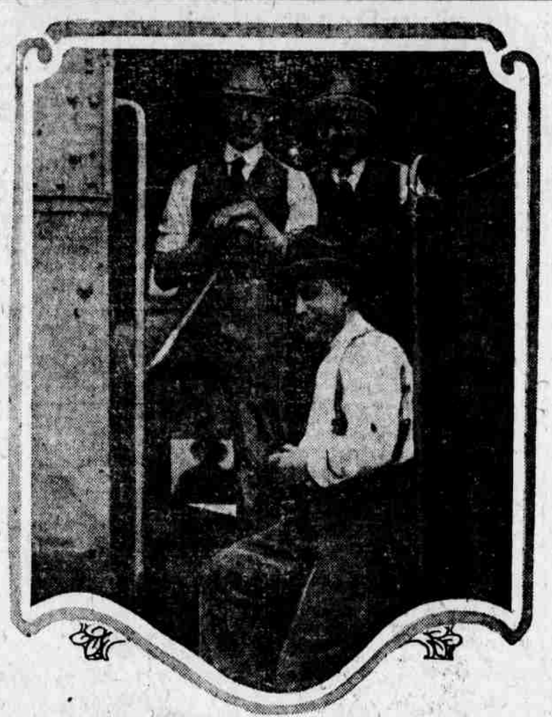
Commuters man locomotive