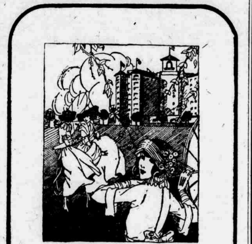
Chicago—The Edgewater Beach