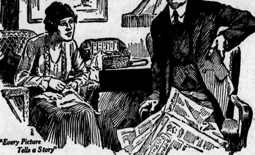
"Every Picture Tells a Story"

HAS Winter left you dull, tired; all worn out? Do you have a constant backache, with headaches, too, dizzy spells, sharp, shooting pains? and some annoying kidney irregularity? Does Spring find you feeling older, slower than you should? From a health standpoint it has been a trying winter. The influenza and grip epidemics have left thousands with weak kidneys and failing strength. Now comes Spring with its own special burdens of impure blood to impose a still greater burden on the over-worked kidneys. Don't wait for some serious kidney trouble to develop. Get back your health and keep it. For quick relief get plenty of rest, sleep and exercise, and help the weakened kidneys with Doan's Kidney Pills . Doan's have helped thousands and should help you. Ask your neighbor!