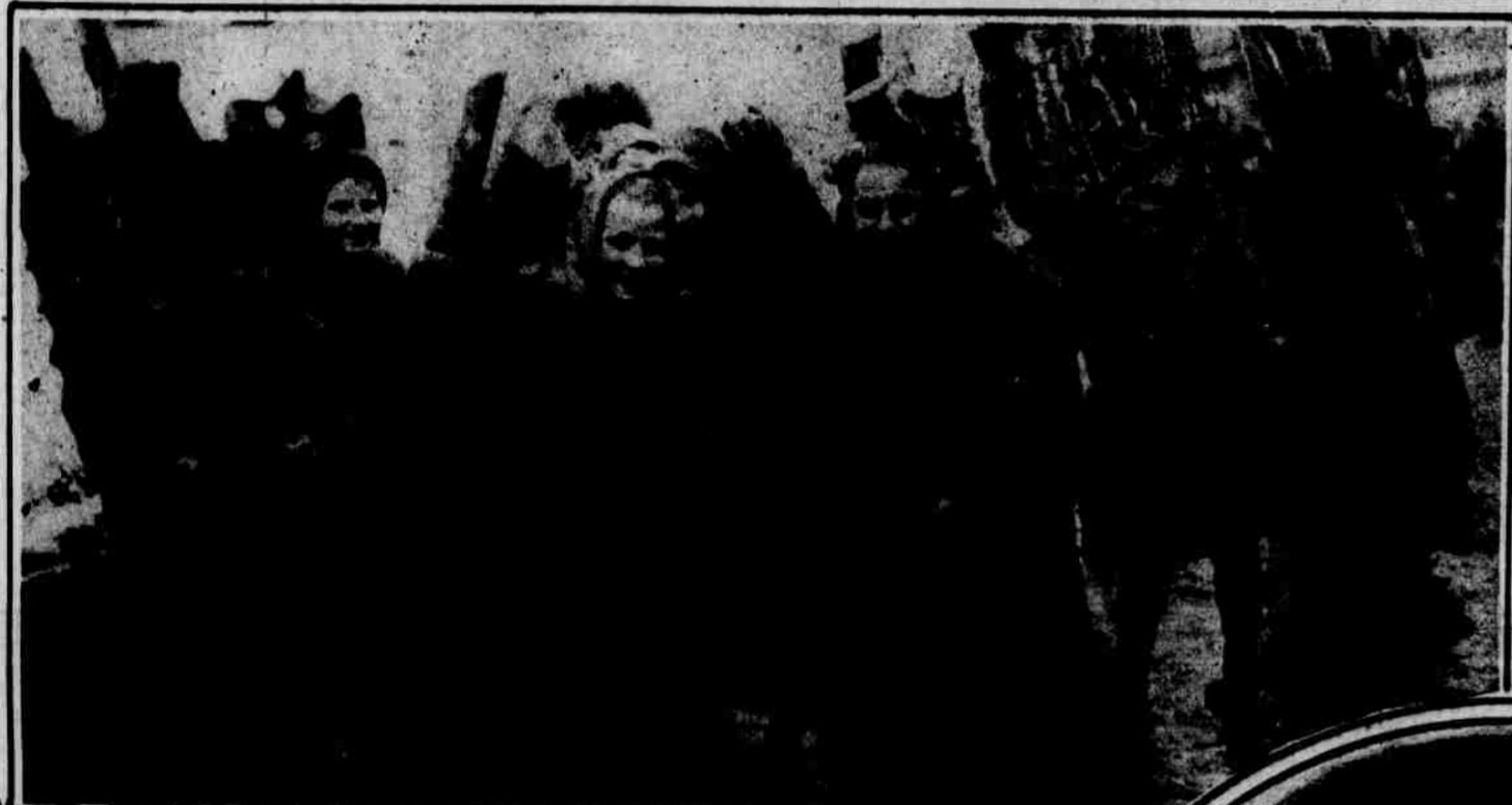
Poor people of Vienna, after cutting wood all day in a forest near Vienna, waiting to take the car back to the city. The forest in which they gather the fuel lies several miles from the capital. It was the royal preserve of ex-Empereur Charles. Those desiring to procure fuel and willing to work for it, trudge out to the forest, cut their supply and depart homeward. Thus do some of the poor solve the problem of getting fuel to keep them and their families from freezing.