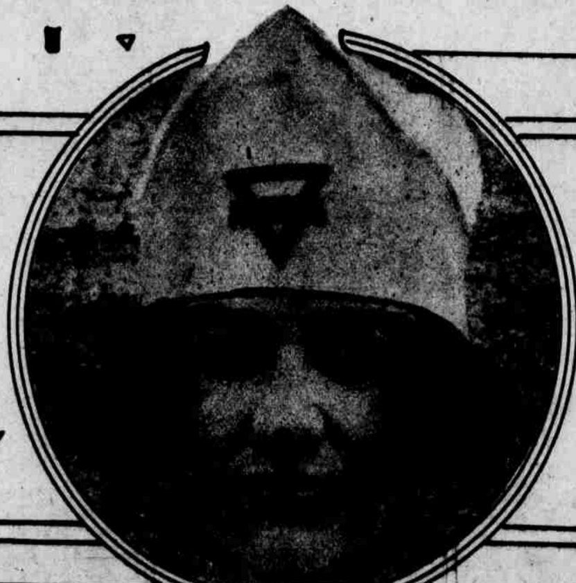
Miss Megan Lloyd George, the pretty young daughter of Mr. and Mrs. Lloyd George, is at present at school in Paris. Miss Lloyd George has acted as private secretary to her mother, and was very active during the war.