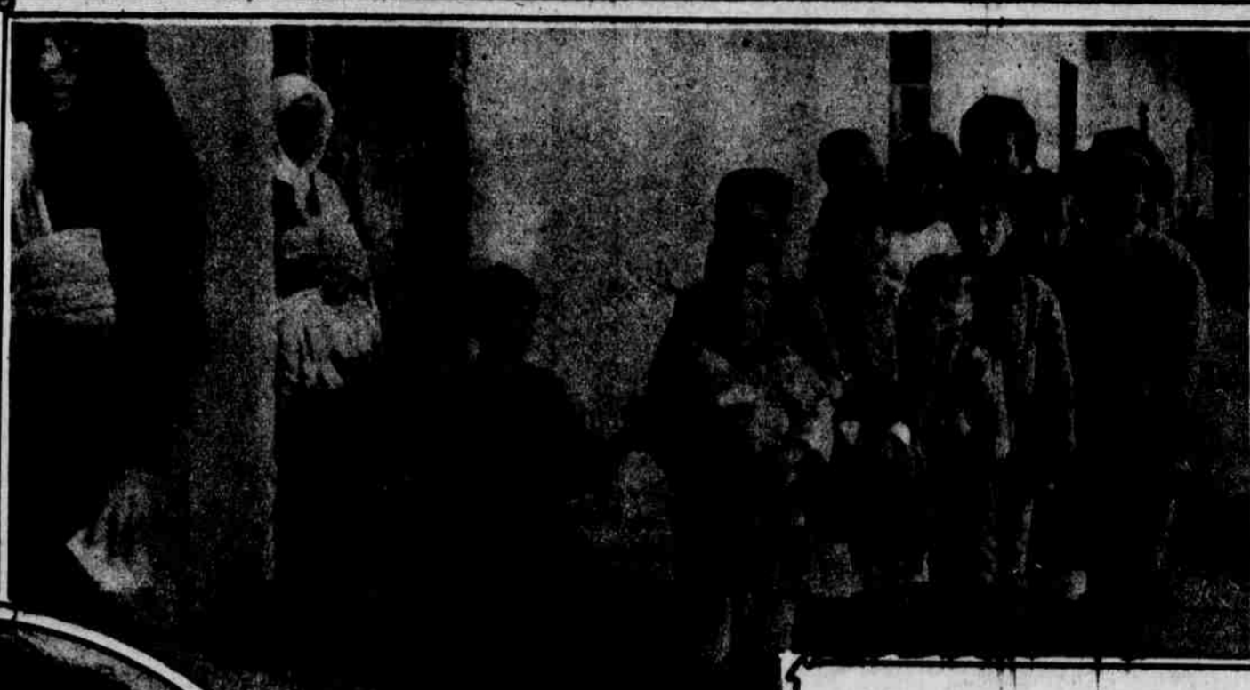
A pitiful sight in Erivan, Armenia, showing starving children of the city in the children's bread line. Often they must stand in line for hours to receive a morsel of bread.