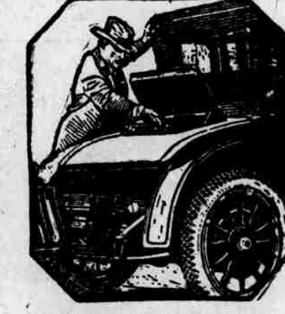
By lifting the small cover in the rear deck, space is given for carrying small articles such as a doctor's case, sample cases, etc.