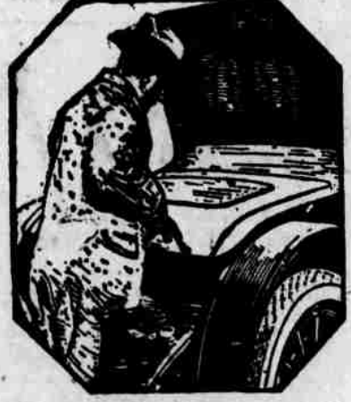
By removing four screws the entire rear deck cover may be taken off.

Come see the Essex Roadster. Ride in it. Try its paces. Whether you want it for business or pleasure, you will appreciate why Essex in its first year set a new world's sales record.