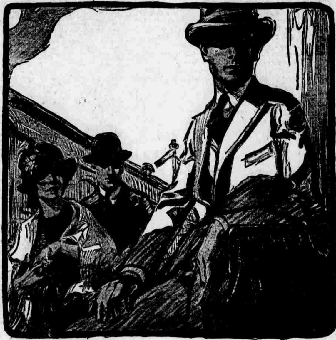
Copyright 1920 The House of Kuppenheimer