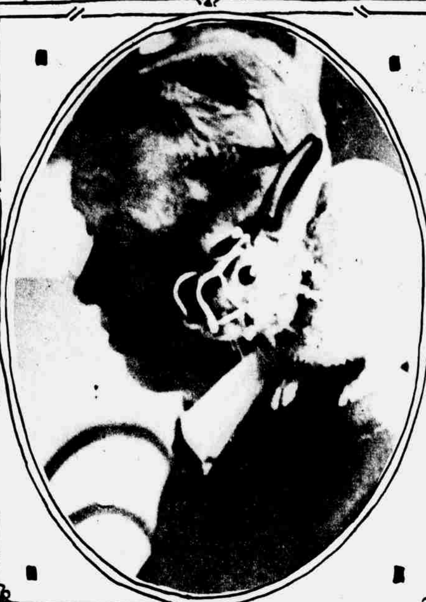
One of the most unusual sights ever seen in a London office is that of a rabbit, carefully muzzled, making the office his own. He was caught wild, tamed, and taught to keep within the bounds of the room. Owing to his nibbling habits, he has to be muzzled during the day, as his depredations on clothing in these expensive days cannot be tolerated.