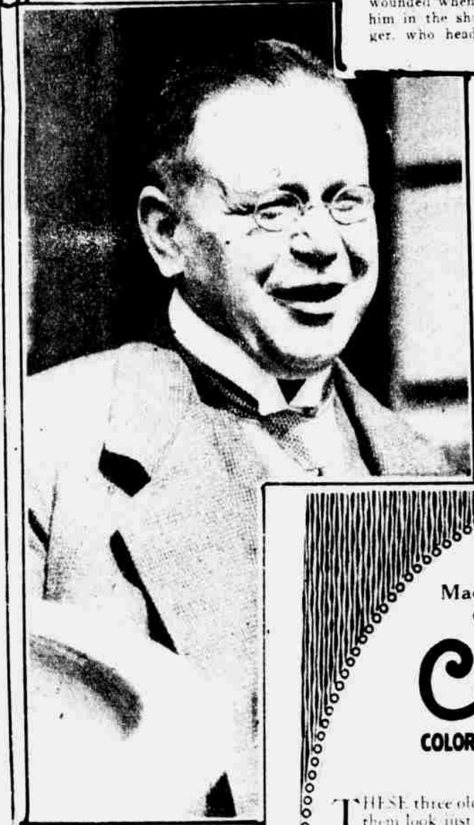
Mathias Erzberger, German Minister of Finance, who was slightly wounded when shot at by an assassin in Berlin. One bullet struck him in the shoulder. This is a recent photograph of Herr Erzberger, who headed the German Commission at the signing of the Armistice.