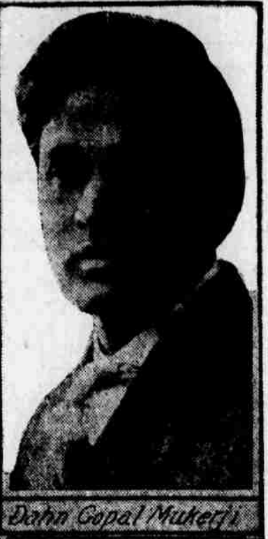
Dahn Gopal Mukerji

Dahn Gopal Mukerji will bring a breath of the beauty and mysticism of the Far East with him when he speaks in Omaha before the Drama league, Tuesday, March 30, Hotel Fontenelle at 4 p. m., on "The India of Tagore and Kipling."