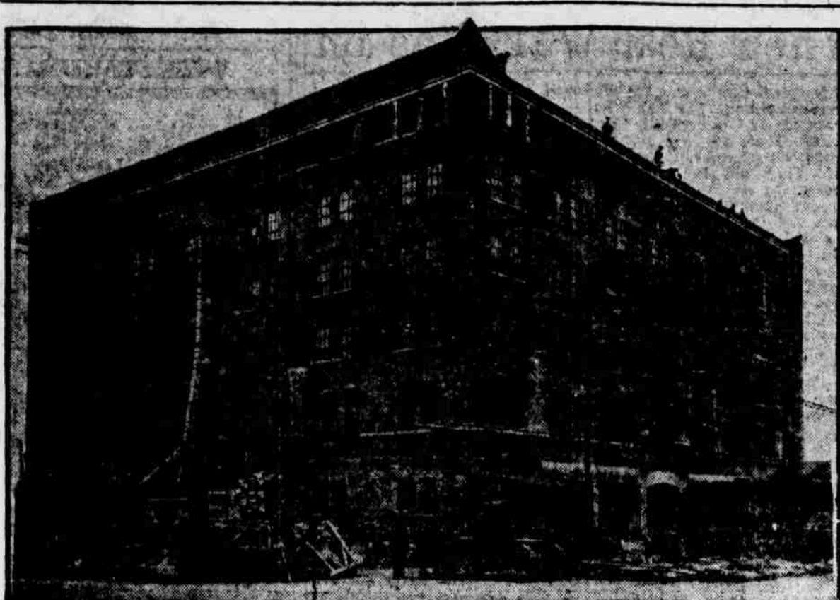
Simon Bros. company is now moving into its new home on the northeast corner of Eleventh and Dodge streets. The building is six stories high and cost approximately $250,000.