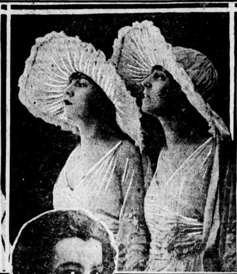
Ford Sisters (ORPHEUM)