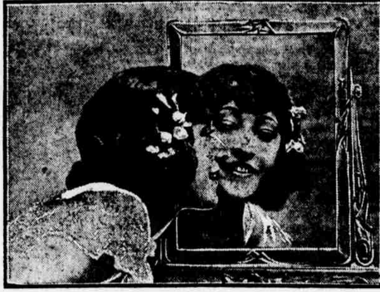
Caring For a Red Nose.

For the home, the street and social affairs. Sane, sensible suggestions by