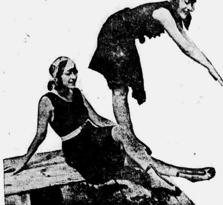
About Getting Slender. We are going to talk about getting thin—then we will tell you thin women how to get fat. You always want to know. I don't know why. Fleshy women would do well to begin a course in physical culture. It's difficult to make yourself take vigorous exercises if you haven't ever had them. Join a class till you get the habit, and then you will be more likely to take them at home—alone.

For the home, the street and social affairs. Sane, sensible suggestions by