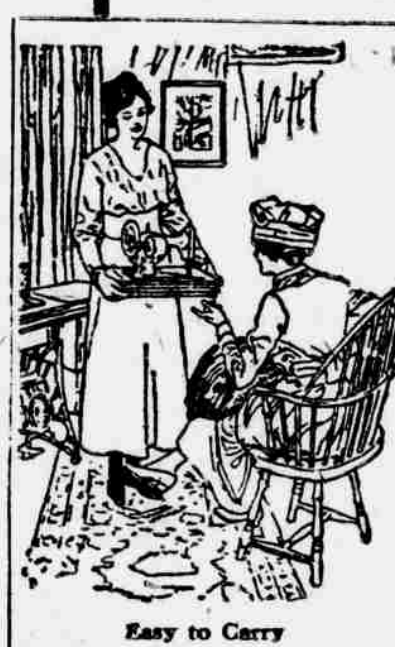
Easy to Carry

One you can carry around, set on any flat surface, and sew to your heart's content without the least bit of labor, unless you would call labor attaching a plug to the socket, releasing the power and guiding the cloth. Simple, isn't it? But best of all, it sews faster, better and it does it more economically. A cent's worth of current will drive a Portable Electric Sewing Machine for several hours.