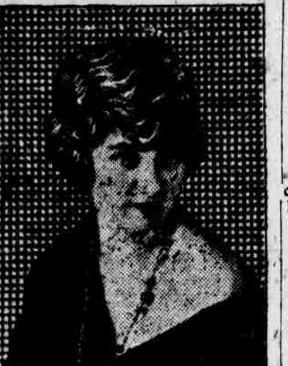
"It's so Easy Now to Have Beautiful Hair."

We want every woman to know not only how easily she can get gray, faded, streaked hair herself but how truly wonderful is the result produced when Brownstone is used for this purpose. Thousands of women already know and use this perfect hair tinting preparation but other thousands have yet to learn, from actual experience, how marvelously it restores to gray, faded and bleached hair its original beauty and glory.