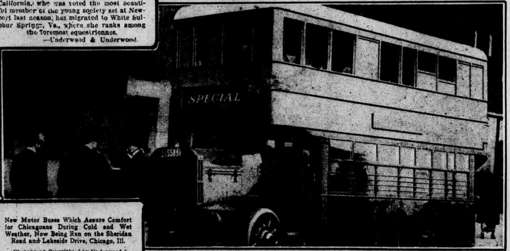
New Motor Buses Which Assure Comfort for Chicagoans During Cold and Wet Weather, Now Being Run on the Sheridan Road and Lakeside Drive, Chicago, Ill.