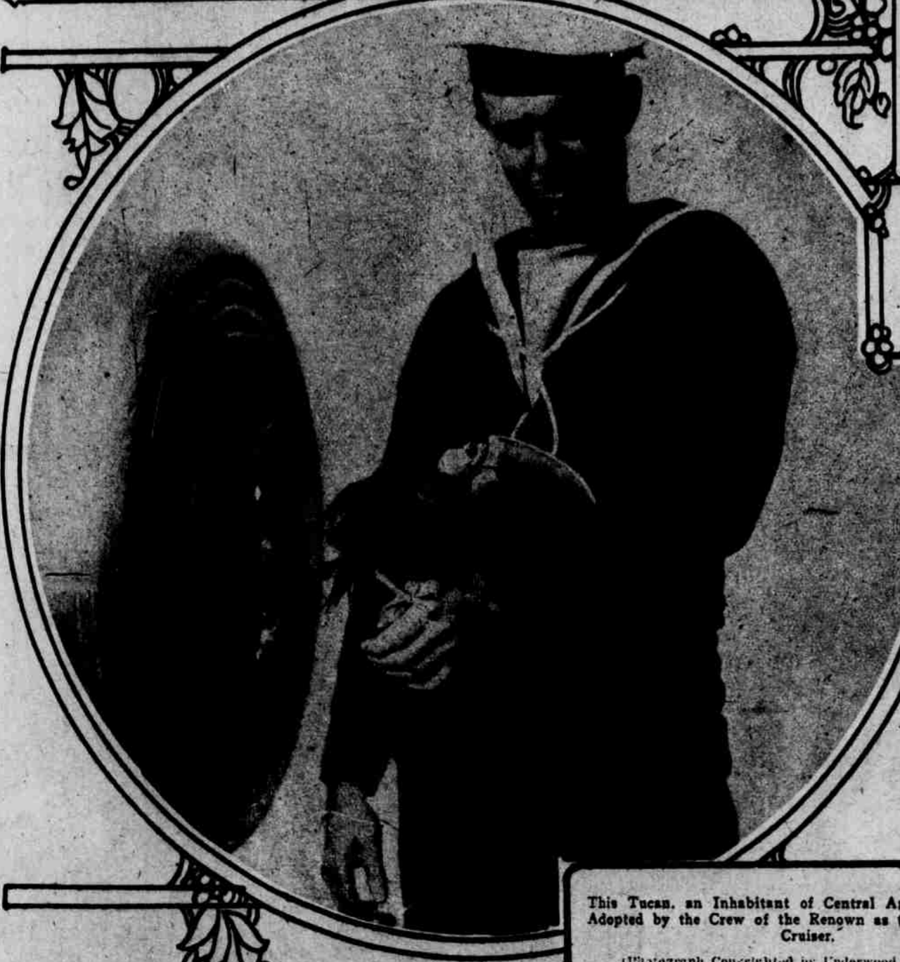
This Toucan, an Inhabitant of Central America, Has Been Adopted by the Crew of the Renown as the Mascot of the Cruiser.