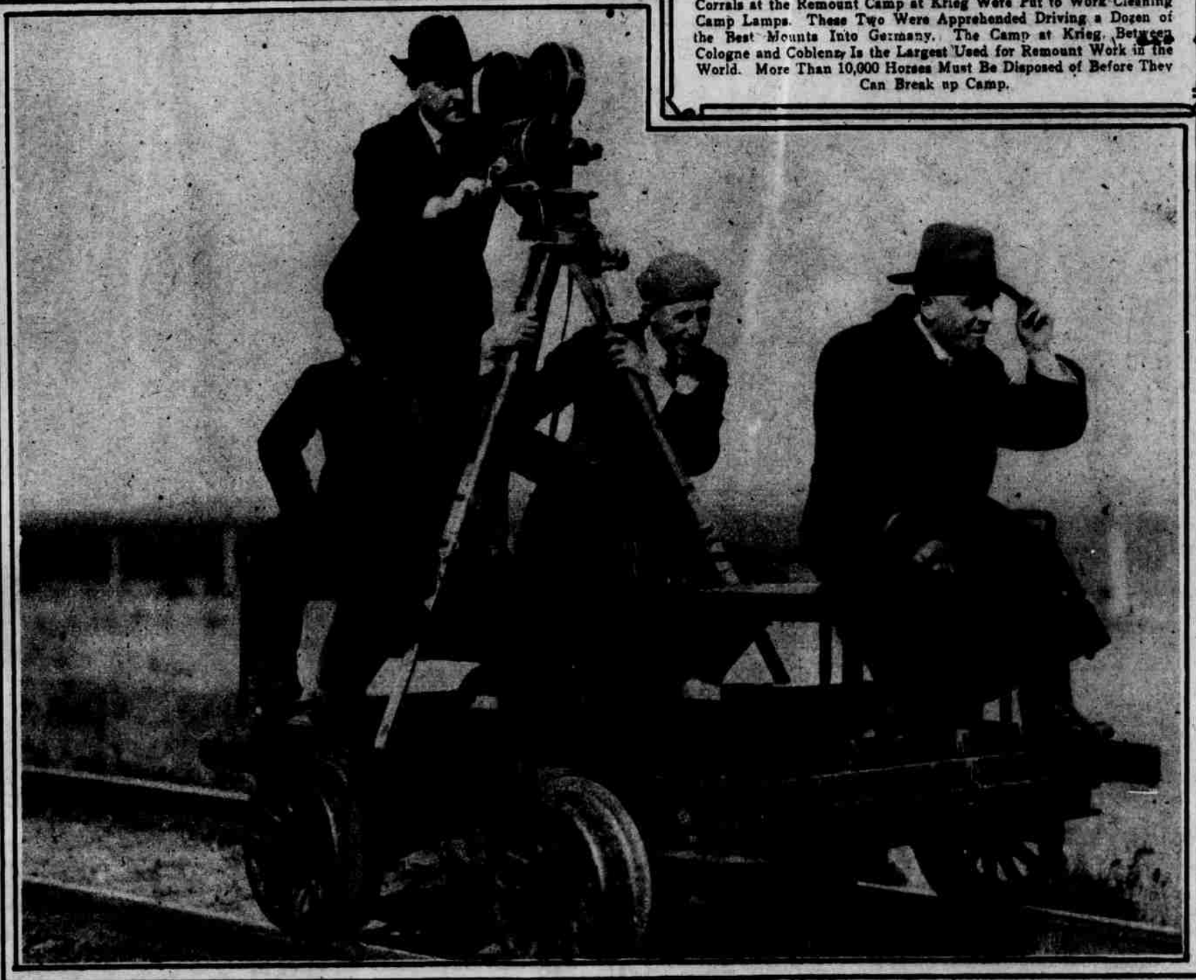
Movie Men on an Electrically Driven Hand-Car Running Ahead of the Prince of Wales' Special Train to Make Moving Pictures of the Train as It Sped Across the Prairie Wheat Lands Near Moose Jaw, Canada.