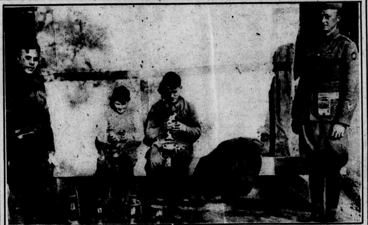
Young Germans Caught "Rustling" Horses from United States Army Corrals at the Remount Camp at Krieg Were Put to Work Cleaning Camp Lamps. These Two Were Apprehended Driving a Dozen of the Best Hounds into Germany. The Camp at Krieg, Between Cologne and Coblenz is the Largest Used for Remount Work in the World. More Than 10,000 Horses Must Be Disposed of Before They Can Break up Camp.