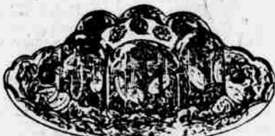
Makes a Pint Dessert Like This

Present the coupon to your grocer this week. Buy two packages of any flavor and he will give you a full-size package of Jiffy-Jell in Loganberry or Pineapple flavor free.