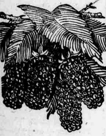
Loganberry Juice Comes condensed in a vial in Loganberry Jiffy-Jell. You get the juice of many berries in a pint dessert.

This is an offer to buy you this week a Jiffy-Jell dessert for six people. Many housewives don't know what Jiffy-Jell means to them.