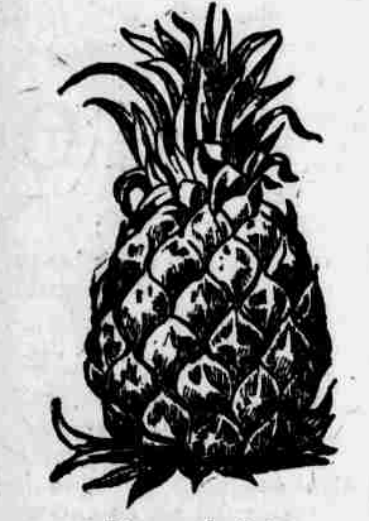
Pineapple Juice Comes condensed in a bottle in Pineapple Jiffy-Jell. We use the juice of half a pineapple to flavor a pint dessert.