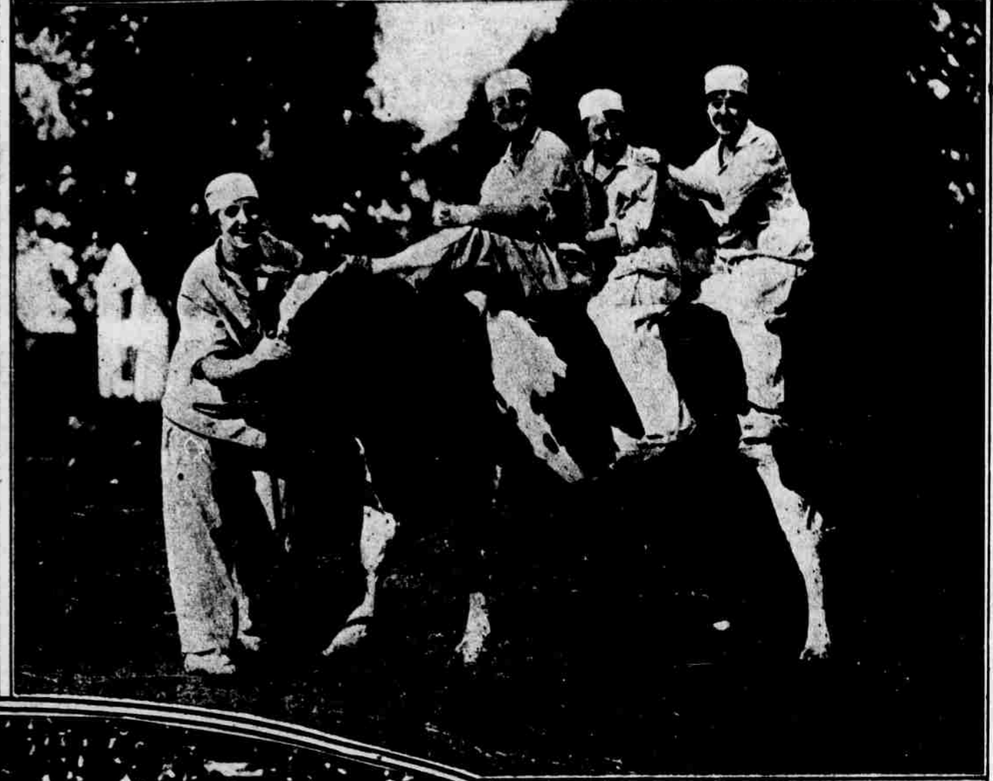
You never can tell what they're going to do in Boston these days. Think of what the Puritan fathers would say if they saw these students of the gentle art of dairying taking a ride on the dairy!