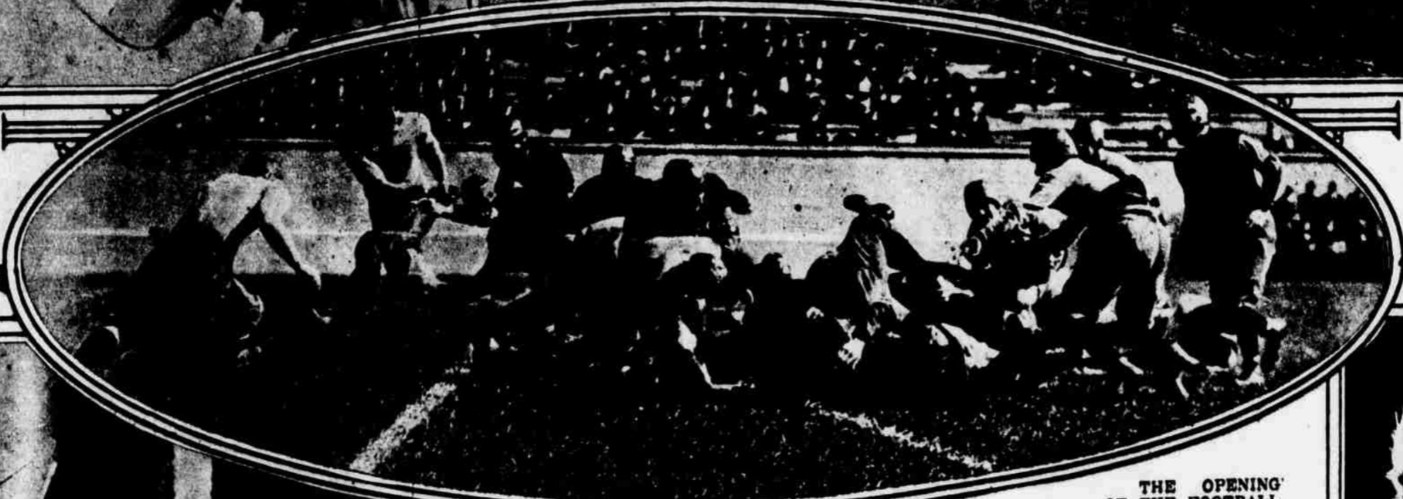
THE OPENING OF THE FOOTBALL SEASON. The Harvard University Varsity Football Team Smashing the Line of the Bates College Eleven in Harvard's First Regular Game of the Season.