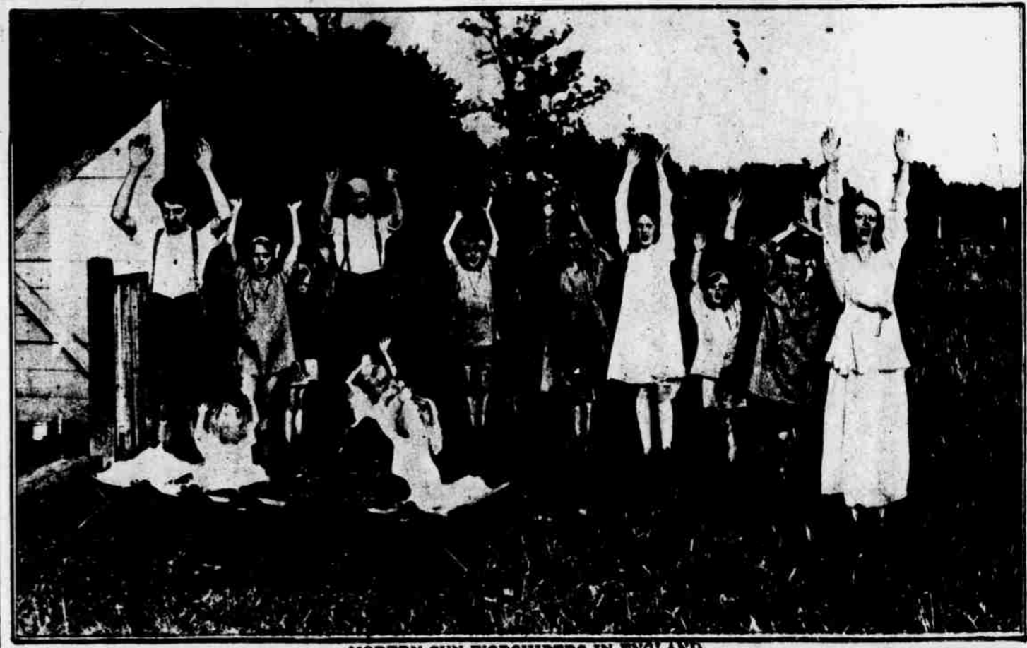
MODERN SUN WORSHIPERS IN ENGLAND. A colony which rejoices in the name of Kosmon Dawn Faithists has revived at Plymouth, England, the worship of the sun which was practiced in ancient times. The disciples of the cult are vegetarians, teetotalers and abhorers of tobacco. The photograph shows the way they greet the rising sun. The worst part of this kind of worship is getting up so early.