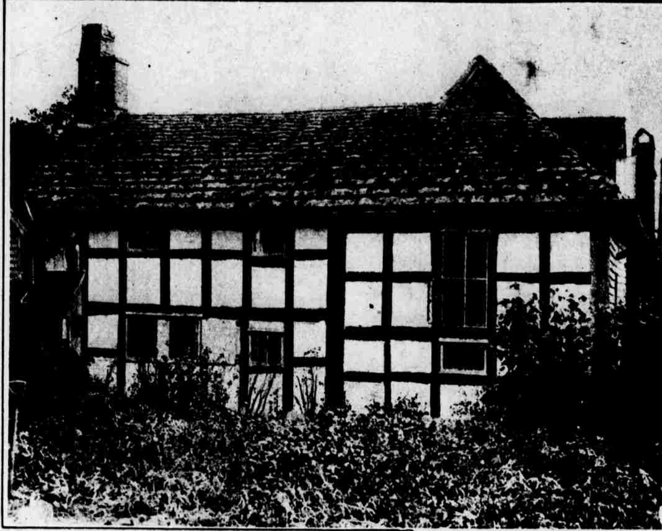
The "Blue Idol," a 17th Century Quaker Meeting House in Coolham, Sussex, England, Where William Penn Worshipped for 10 Years.