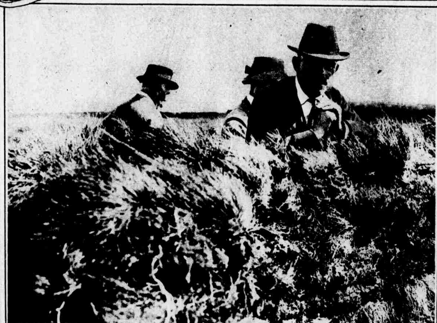
The Hon. Capt. Sir Algernon Osborn at the Butts on the Third Beat, Evidently Watching to See That None of the Birds Attacked the Guests.