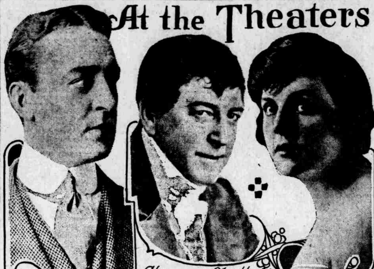
William Courtenay in "Civilian Clothes"

Tells why everyone should drink hot water each morning before breakfast. To see the healthy bloom in your face, to see your skin get clearer and clearer, to wake up without a headache, backache, coated tongue or a nasty breath, in fact to feel your best, day in and day out, just inside bathing every morning for a week.