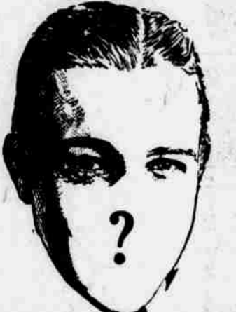
Watch and See More Tomorrow.