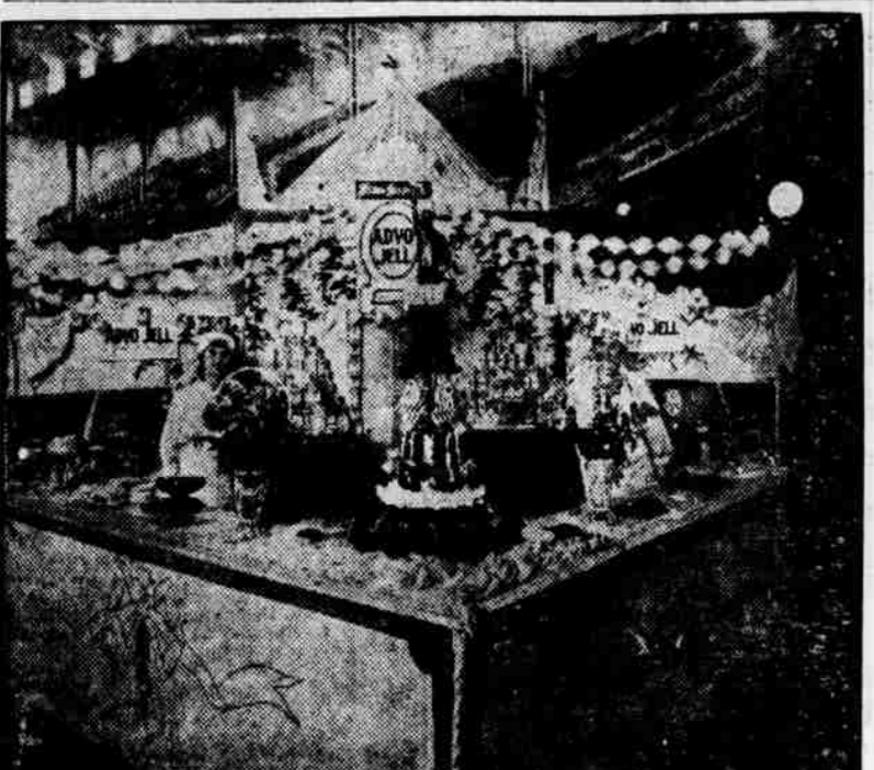
(Advo-Jell)—McCord-Brady's Advo-Jell booth is conceded to be the prettiest booth at the show. Also one of the busiest.