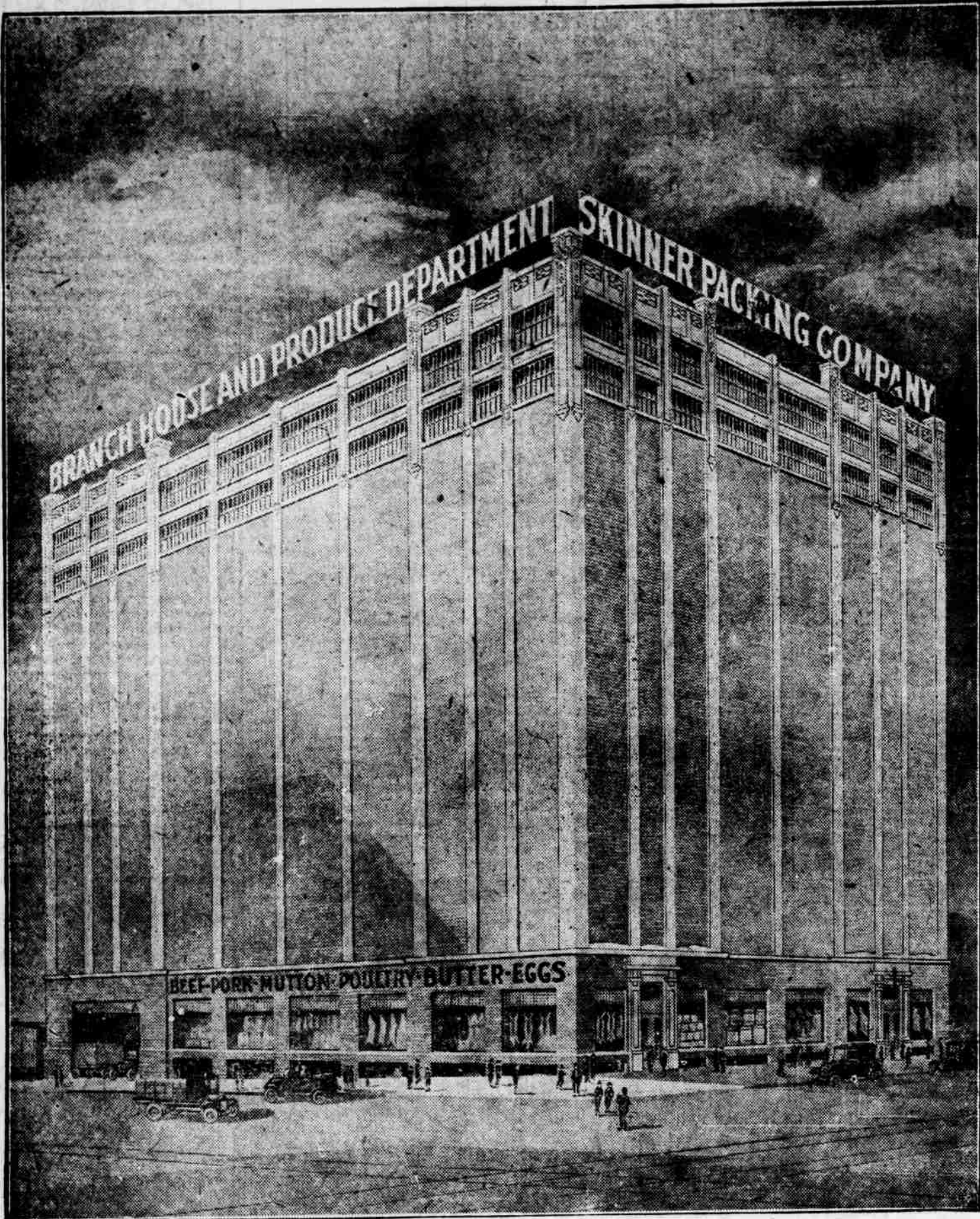
Over 2 \frac{3}{4} Acres Floor Space