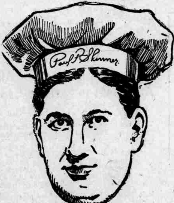
Trade Mark Registered— U. S. Pat. Off. and Fgn.

As stated above, this department is owned by the Skinner Packing Company and if you desire any information on the securities of the Skinner Packing Company, we would be glad to have you mail us the attached inquiry blank and give you any information you want.