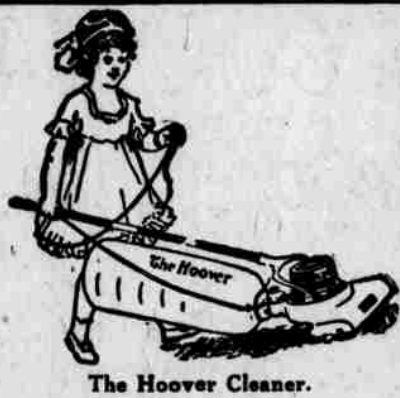
The Hoover Cleaner.