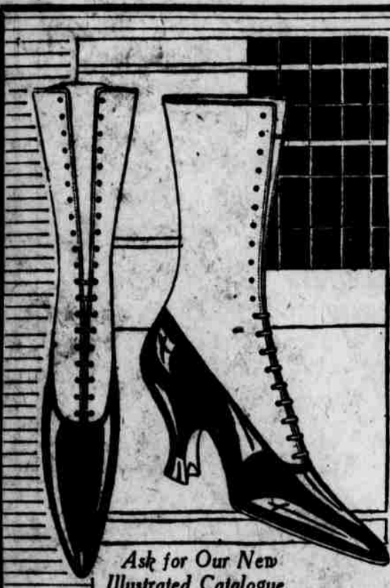
Ask for Our New Illustrated Catalogue.

"The Passing Show" requires no explanation to anyone—it is known the world around for its girls, music and jollity—its appeal is universal. Full of color, youth and gaiety, it is, in truth, a spectacle that will put a new outlook on life to the most jaded disposition. Critics have remarked that "The Passing Show" gets better every year, and to those who have seen the performance in other cities, the present cast and plot is no exception to that remark. All that's new in music, in the effects that go to make up a colorful presentation, are embodied in this whirlwind performance. It really can be described in no other terms.