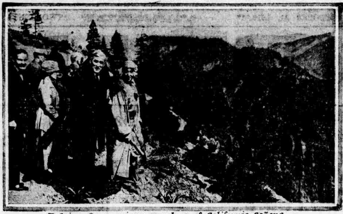
Belgian Queen views wonders of California canons.

BELGIAN QUEEN VIEWS WONDERS OF CALIFORNIA CANONS—Queen Elizabeth, of the Belgians, with her party, viewing the wonders of the American river from a point along the Blue Canon, Cal. The king and queen are now seeing the sights in the west and were visibly impressed with the grandeur of this section of the United States.