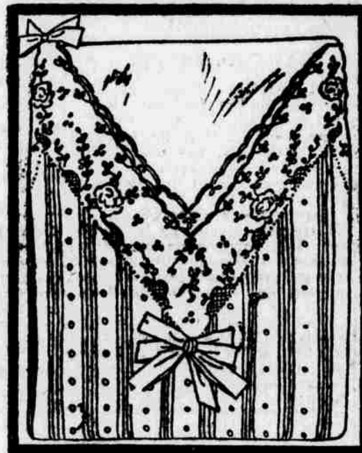
Envelope Chemise, $5.95

All hand sewn, scalloped and embroidered in spray designs. Arm size or shoulder strap effects. The material is nainsook.