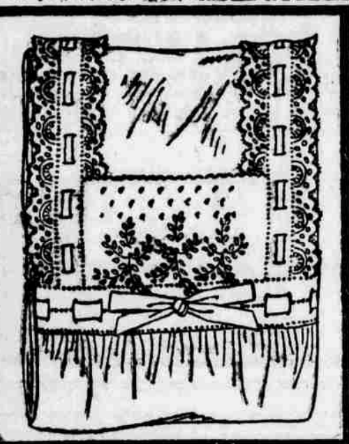
Envelope Chemise, $3.95

Fine nainsook, embroidered in floral and block designs and scalloped by hand. A dainty and practical undergarment.