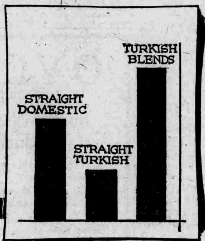
Chart No. 2 Turkish blends are so popular that their sales almost equal the combined sales of the other two kinds of cigarettes.