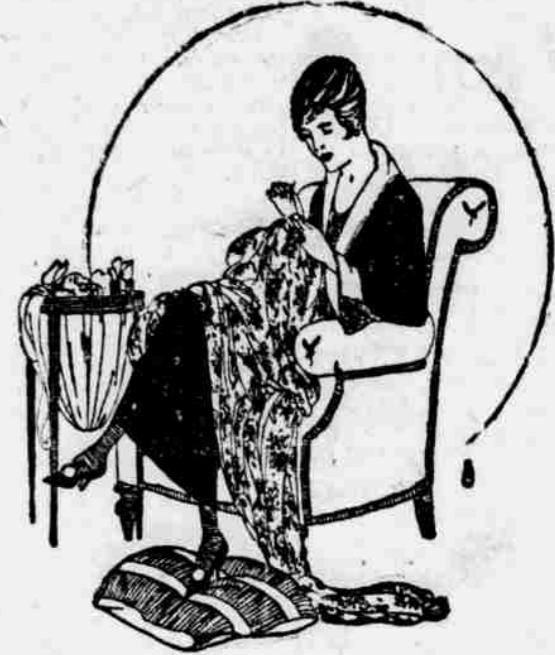
Right Reserved to Limit Quantity

THERE is a restful satisfaction in rounding out your purchase from our Notion Displays. It means so much to find just the shade of silk you wish to exactly match your new frock and the gratifying variety in novelty and art-cut buttons to give delightful contrast or harmony when you are completing your final plans. But, between essential things like thread and buttons, there is a world of necessary little things well displayed "to help you remember."