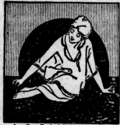
Any Corn Peels Off With "Gets-It."

It is easy for "Gets-It" to reach "hard-to-get-at" corns, and better yet, it is easy to remove them, because "Gets-It" makes them come right off just like a banana.