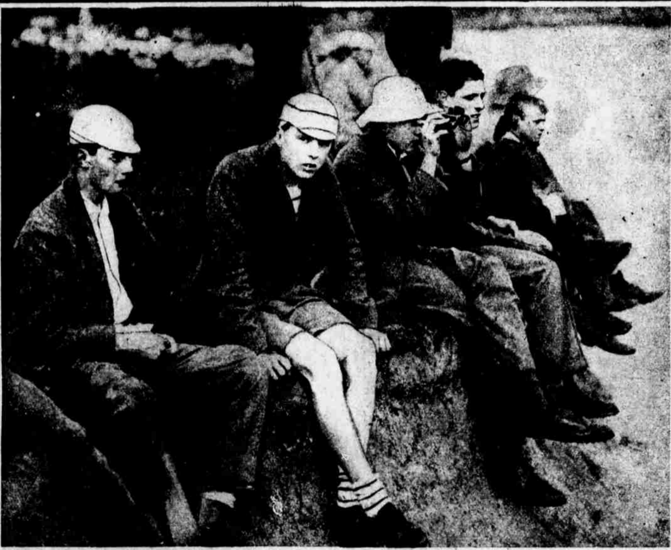
Eton College boys watching a boat race in England.