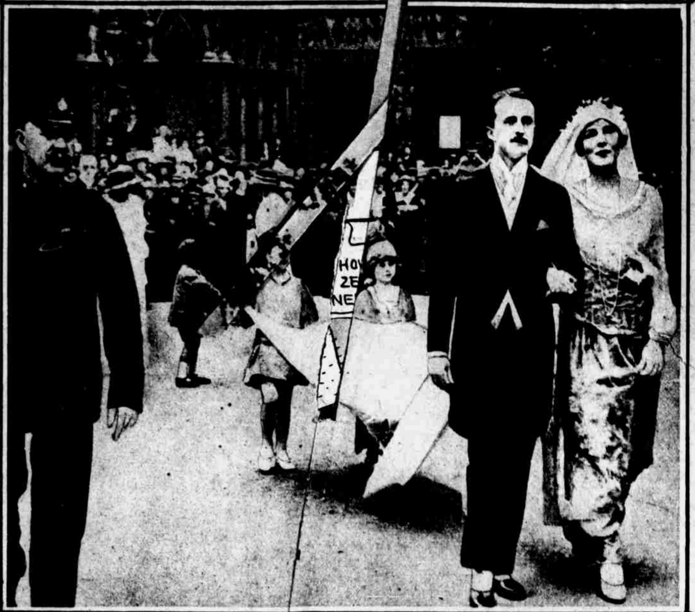
Lady Diana Manners and her husband, Capt. Duff Cooper of the Grenadier Guards, leaving St. Margaret's after the wedding ceremony. Lady Diana Manners is the youngest daughter of the Duke of Rutland and is considered one of the most beautiful women of Great Britain.