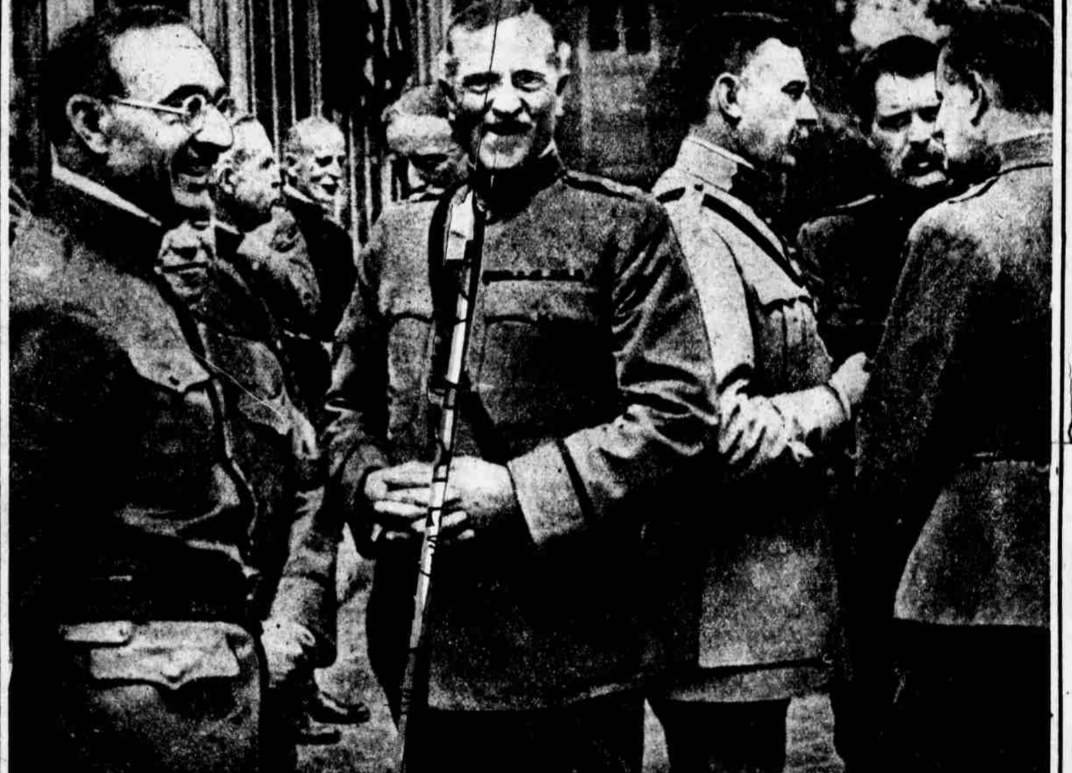
Rare indeed are the pictures which portray as well as this the smile of Gen. John J. Pershing, commander-in-chief of the American Expeditionary Forces in France. This photograph was taken at the Pavillon Horloge, Paris.