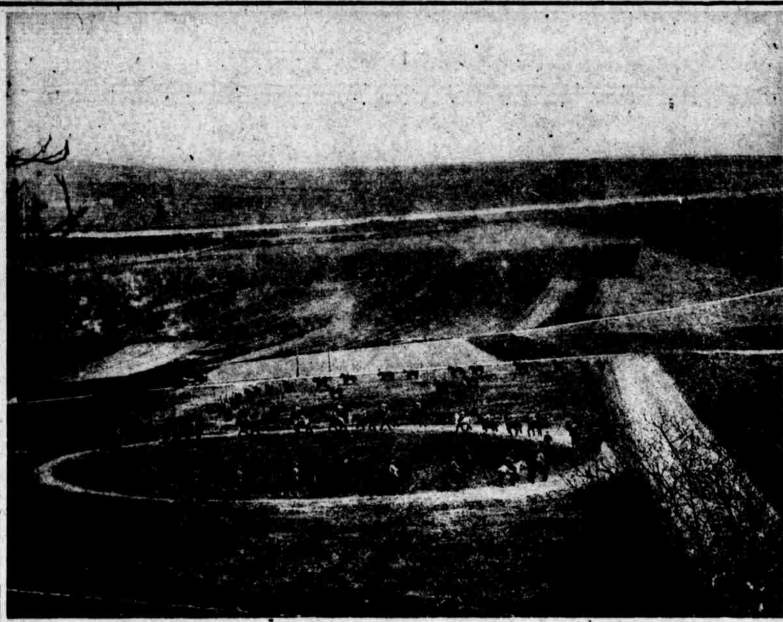
Polish cavalry training at the cantonment at Lens.