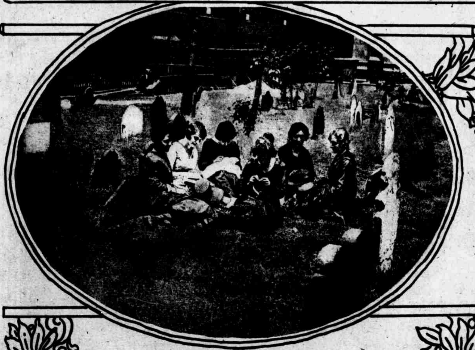
Usually one would not select a graveyard to lunch in or to spend the luncheon hour, but in the Trinity Churchyard, that venerable spot in New York, girls do this regularly without even thinking that they are doing anything extraordinary.