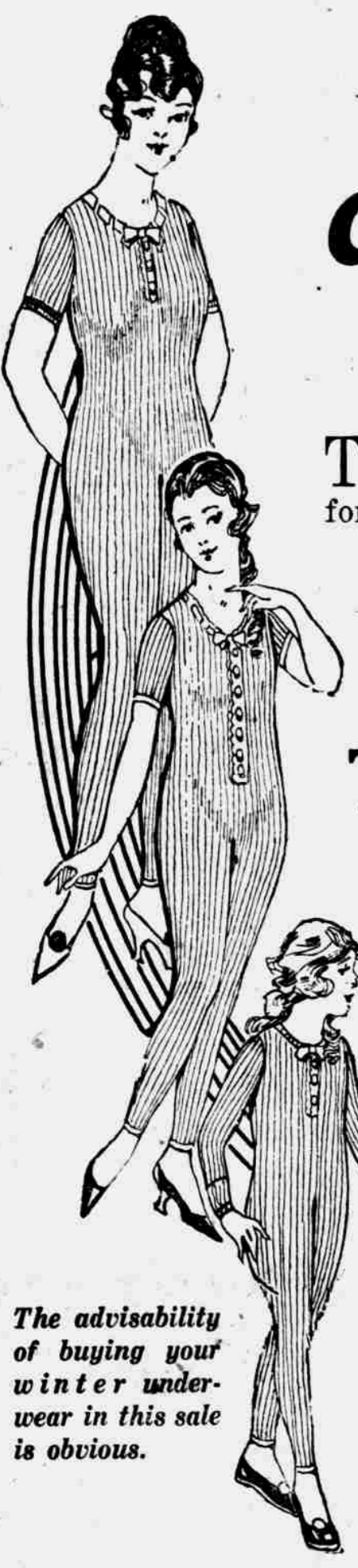
The advisability of buying your winter underwear in this sale is obvious.

After reading the few lines above, it should be immediately apparent to every shrewd person that this is a golden opportunity to buy an entire supply of fall and winter underwear for all the family at one-half and less than one-half the price one will have to pay a few weeks hence. The various offerings follow: