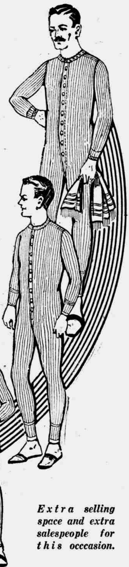
Extra selling space and extra salespeople for this occasion.