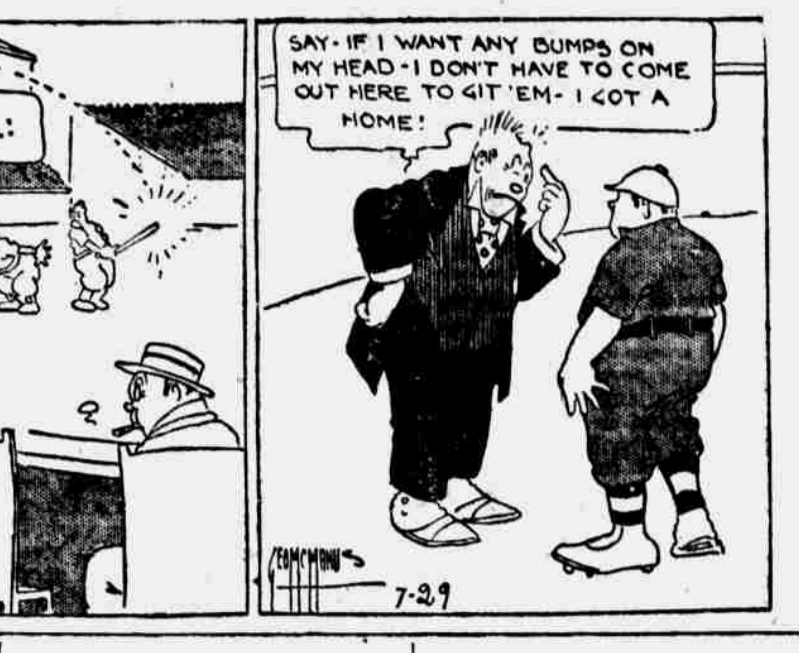
IF I WANT ANY DUMPS ON MY HEAD-I DON'T HAVE TO COME OUT HERE TO GET 'EM-I GOT A HOME!