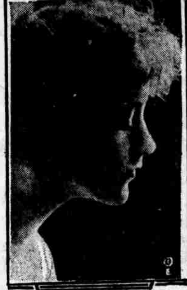
Constance Talmadge (ORPHEUM-SO. SIDE)