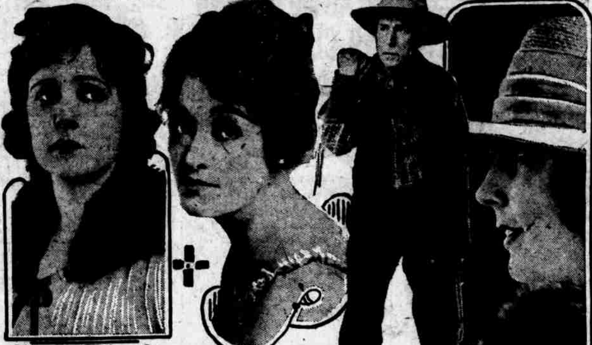
Norma Talmadge (MUSE)