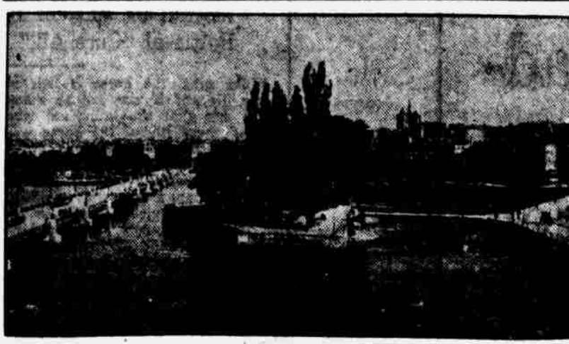
A general view of Geneva, Switzerland, with "Rousseau's Islands" and the Mont Blanc, the highest mountain in Europe, towering in the distance.