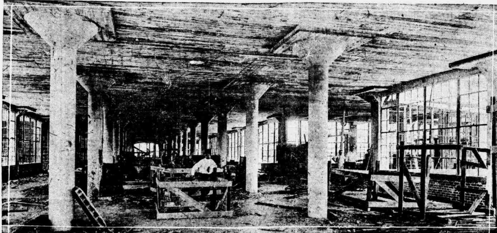
One of the five immense rooms this great factory will have when completed, each 75x300 feet. Note the heavy concrete construction; the steel window frames; the gigantic columns; also the large rooms that lead off to the left and right. All columns and side walls are built amply strong to take care of the next three stories.