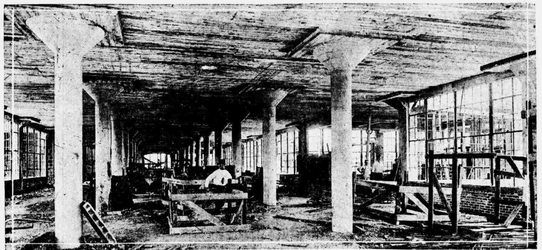
One of the five immense rooms this great factory will have when completed, each 75x300 feet. Note the heavy concrete construction; the steel window frames; the gigantic columns; also the large rooms that lead off to the left and right. All columns and side walls are built amply strong to take care of the next three stories.